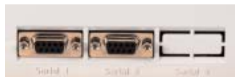
Two Standard RS-232C Ports