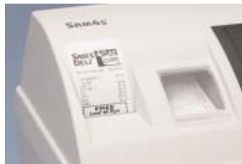
Quick and Easy Drop-In Paper Loading