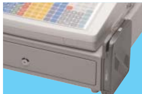
DataTran™ Integrated Credit Option